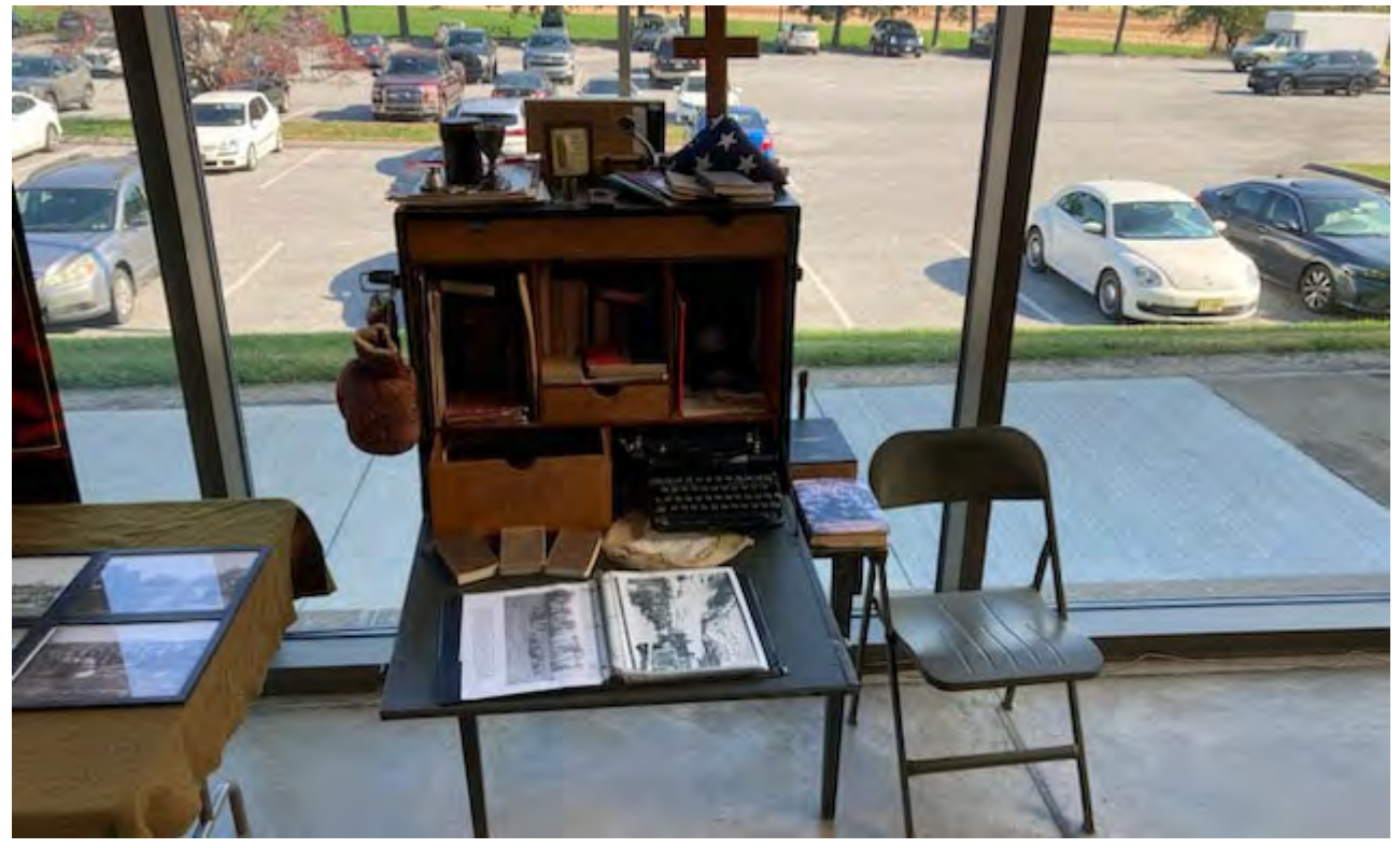
Below is another view of the Chaplaincy display.

The display below shows a Chaplain's field desk and key materials the Chaplain would use to support soldier moral and spiritual needs.