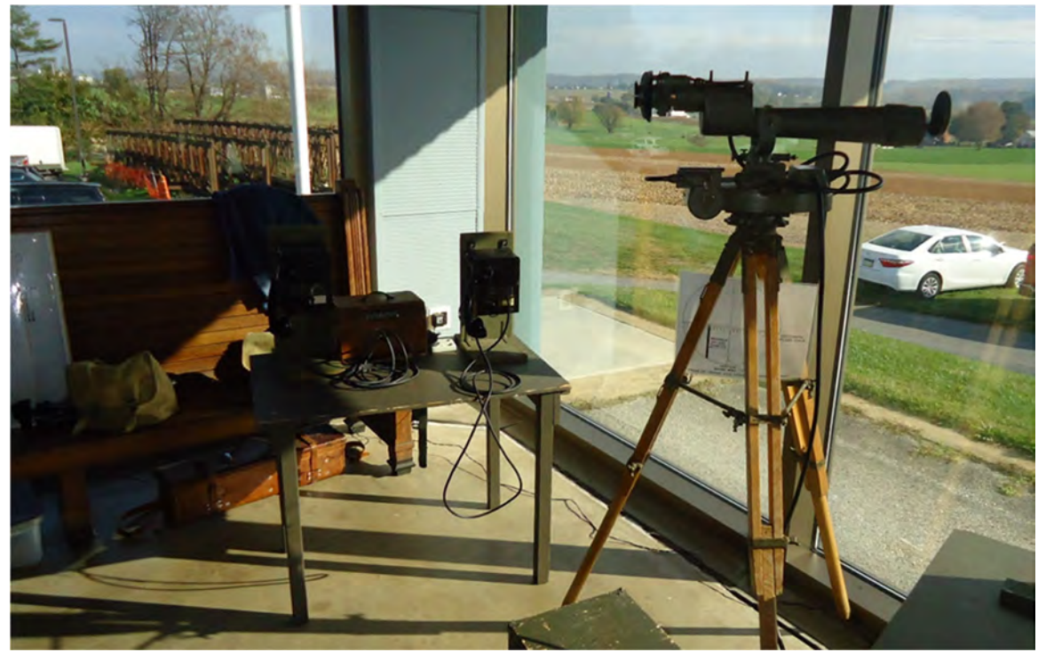
A view through the azimuth to the distant fields and wood line showing the detail of the image.

A M1910A1 Azimuth Instrument in our corner display area, set to look out over the expansive countryside view so visitors could see the magnification capability. Two EE-91 fire control telephones are also shown to the left of the instrument.