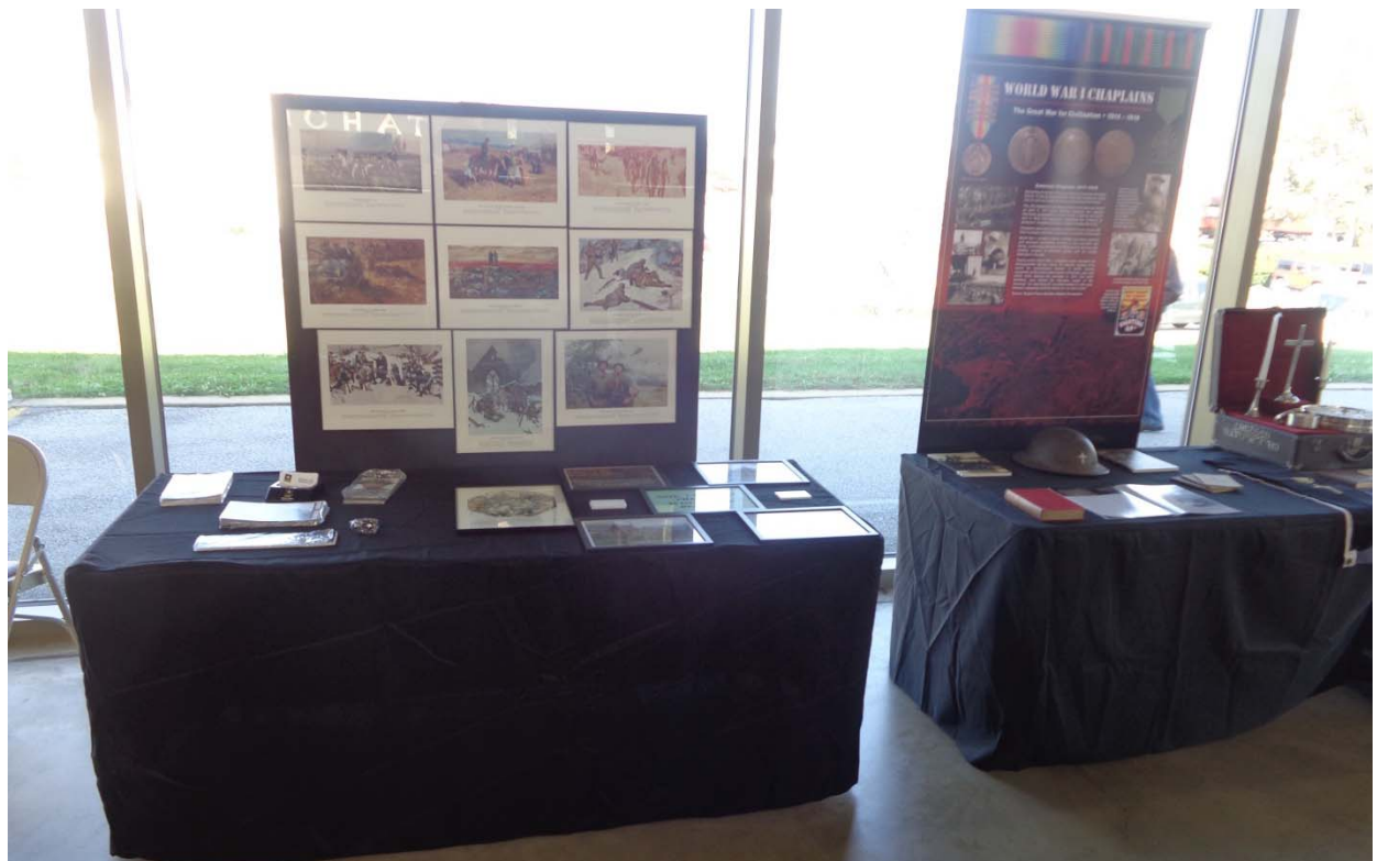
JCPT (CH) Uhler's display shows clearly the various ecclesiastical items including communion equipment as used during field services.

The displays below include "Chaplain Art" from the Army Heritage Center.