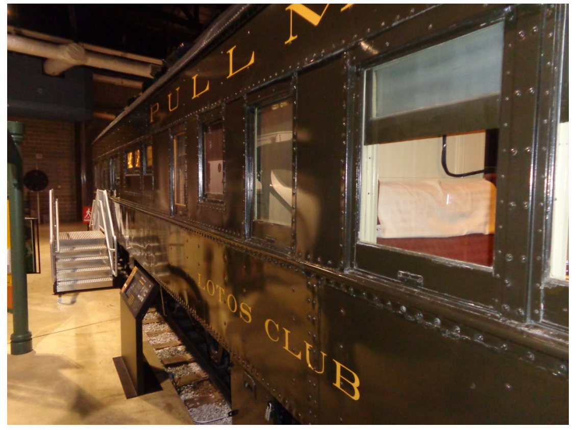
The tables are set inside the Lotos Club car as shown below.

One of the neatest displays is the Pullman "Lotos Club" car - a very rare glimpse into "High Society" of the 1870s to 1940s.