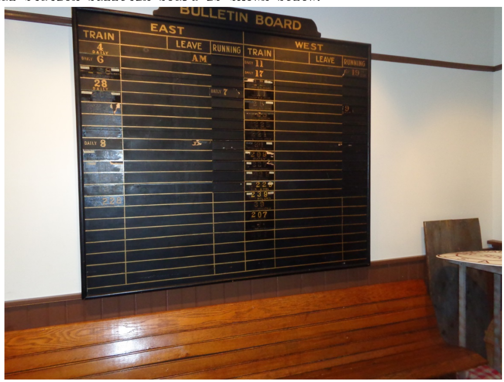
Another view - the Railroad Station's waiting room is shown below.