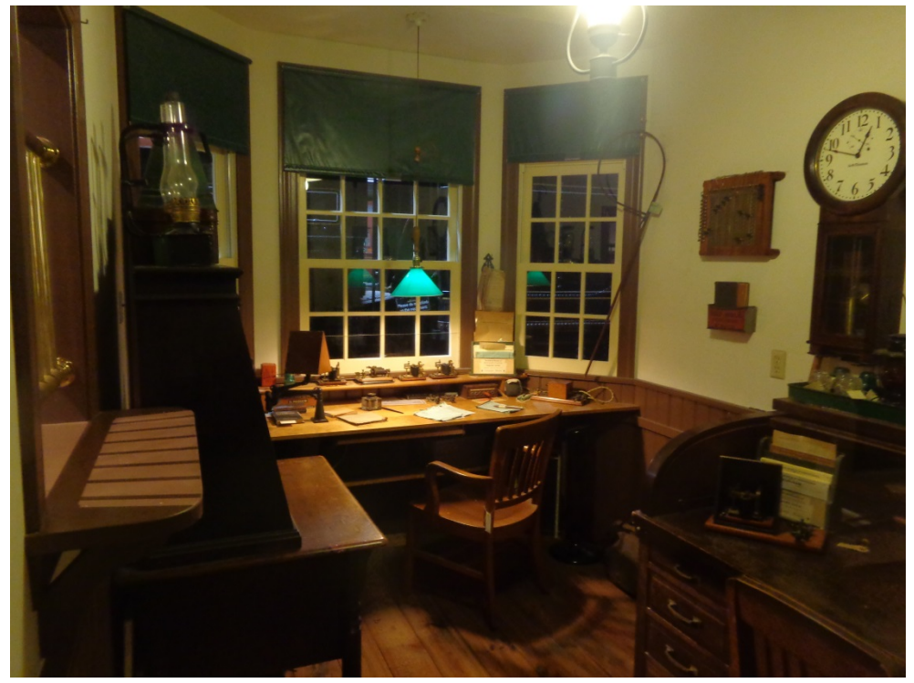
Another view of the interior of the station master's office.

The Station Master's office is shown below to include various telegraph and telephone installations.