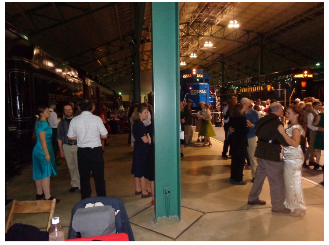
The music was excellent and everyone had a great time.

In addition to many of the exhibitors, several local swing dance clubs were present at the dance.