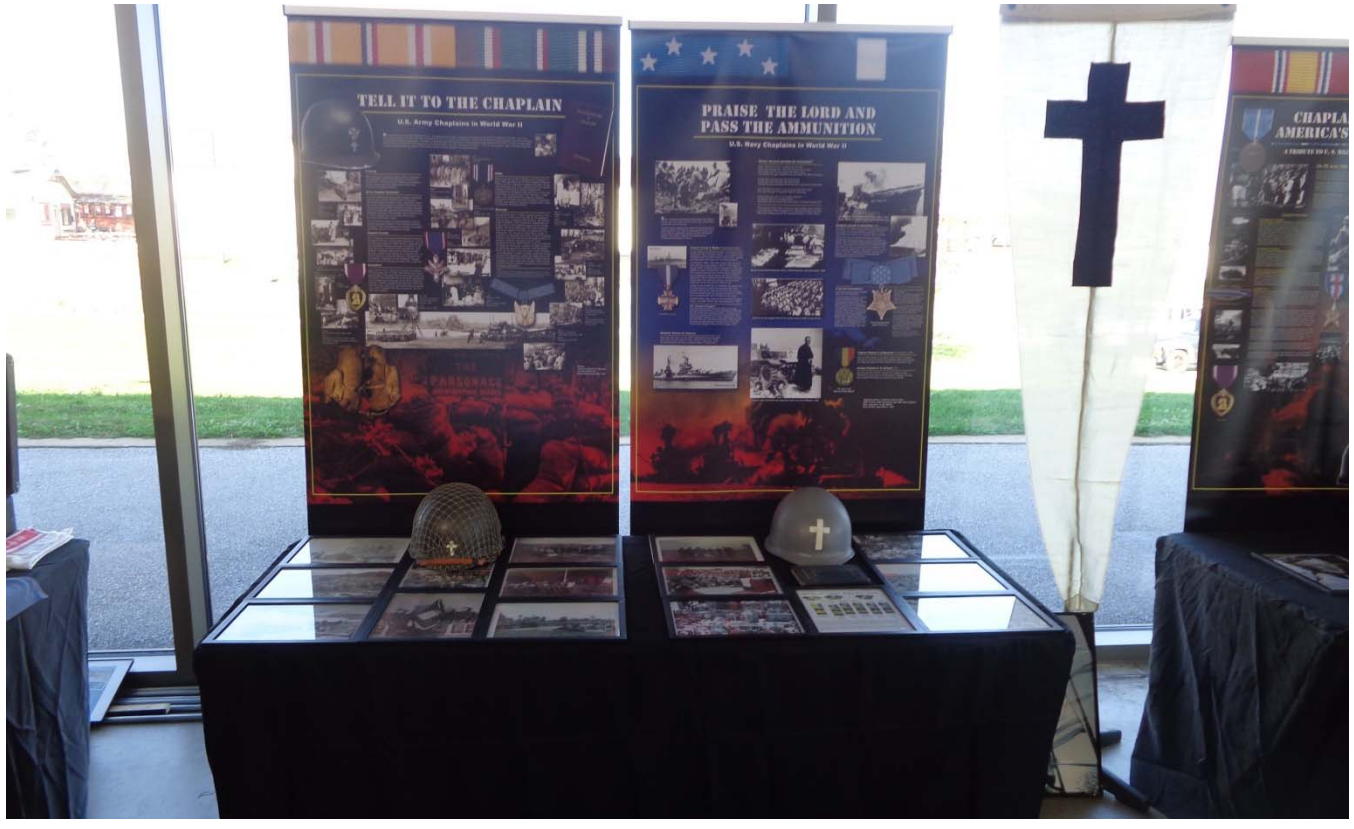
Below is another section of the Chaplaincy display.

The Chaplaincy items shown below includes a Navy Church Pennant. This pennant would be flown from a ship when services were in progress.