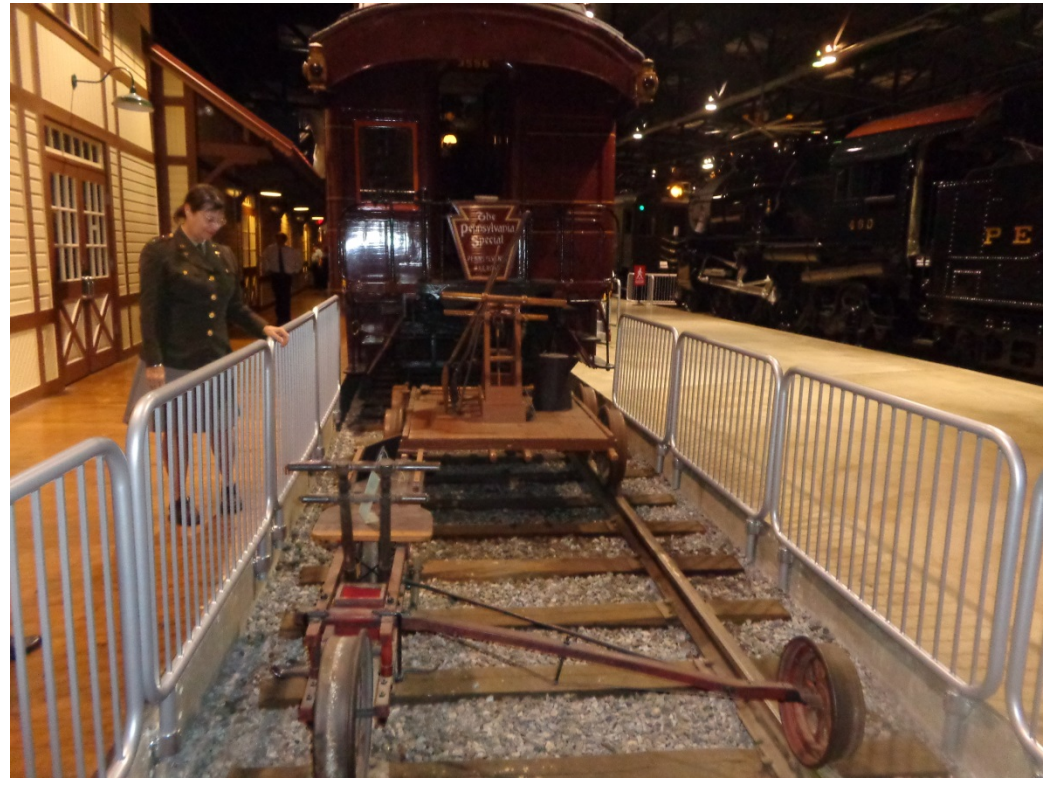
Another view of the interior of the museum, showing a large locomotive on the right and a passenger car on the left.

Two different "human powered" railroad track cars are shown below. These were often used in track inspections by teams of personnel who would find small faults and repair them before they required major work.