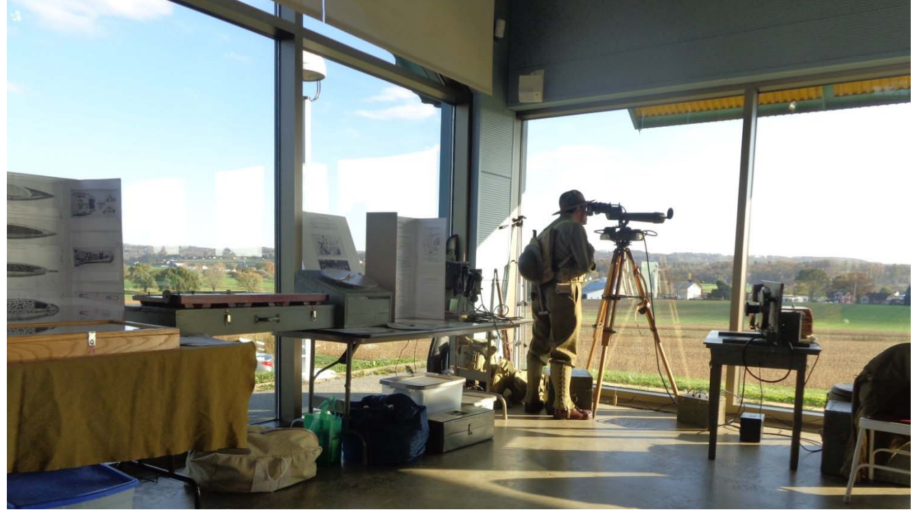
The photo below shows CPL Cusano's view - an antenna about 15 miles distant.

Below is another view off the Coast Artillery display with CPL Cusano observing the countryside looking through the M1910A1 Azimuth Instrument.