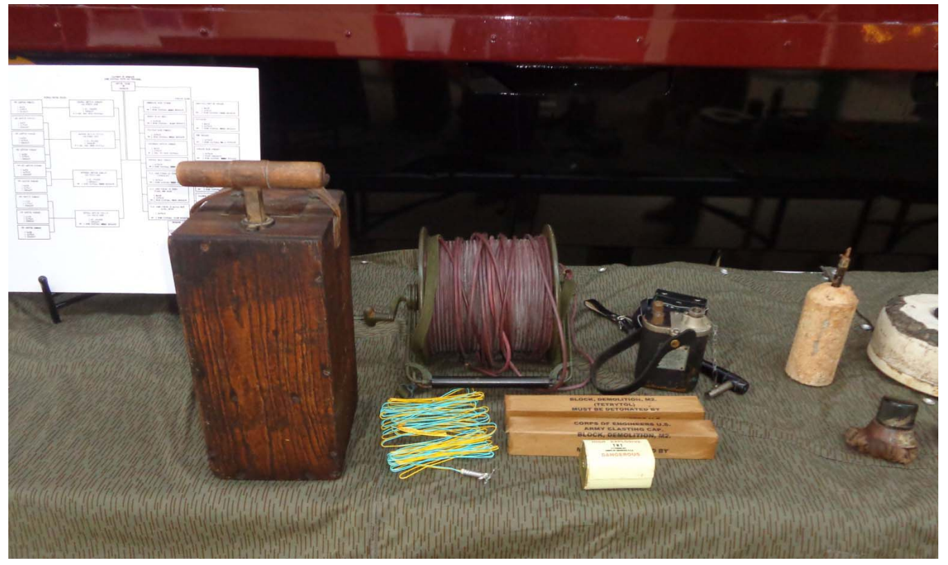
The historic documents below explain how the Army trained and prepared soldiers for the EOD mission in WWII.

Rick's display included classic demolition materials to include a very rare "100 cap blasting machine" on the left in the photo. The reel of demolition wire is also very rare. Training blasting caps (all inert) are also shown on the table.