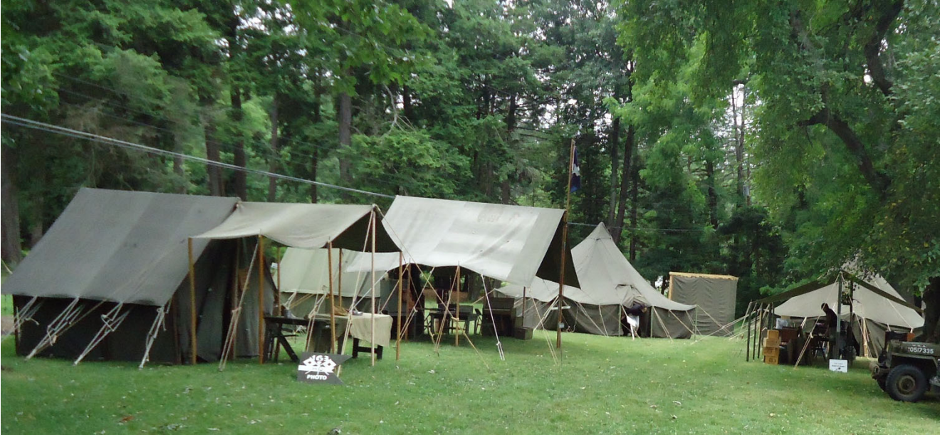
Below is another view of the 45 th ID encampment.

The encampment below is of the 45 th Infantry Division and includes the Chaplain's tent and fly in the center.