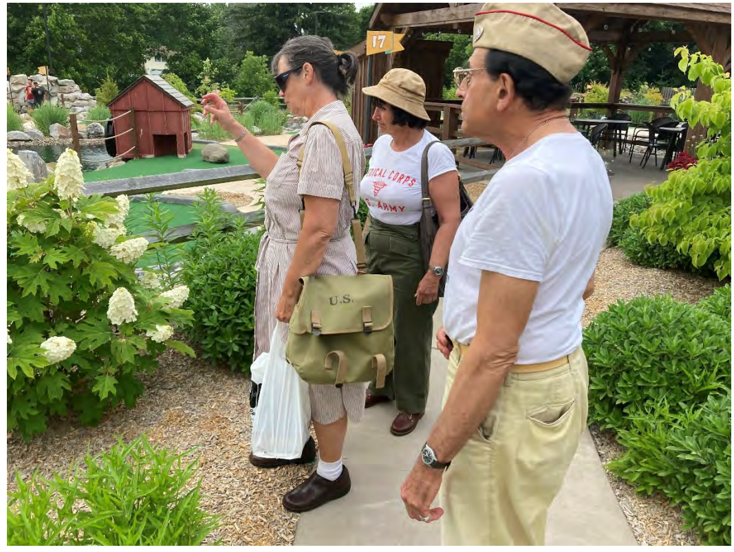
Jacobsburg WWII weekend is well worth your time and we encourage you to attend in June 2023!