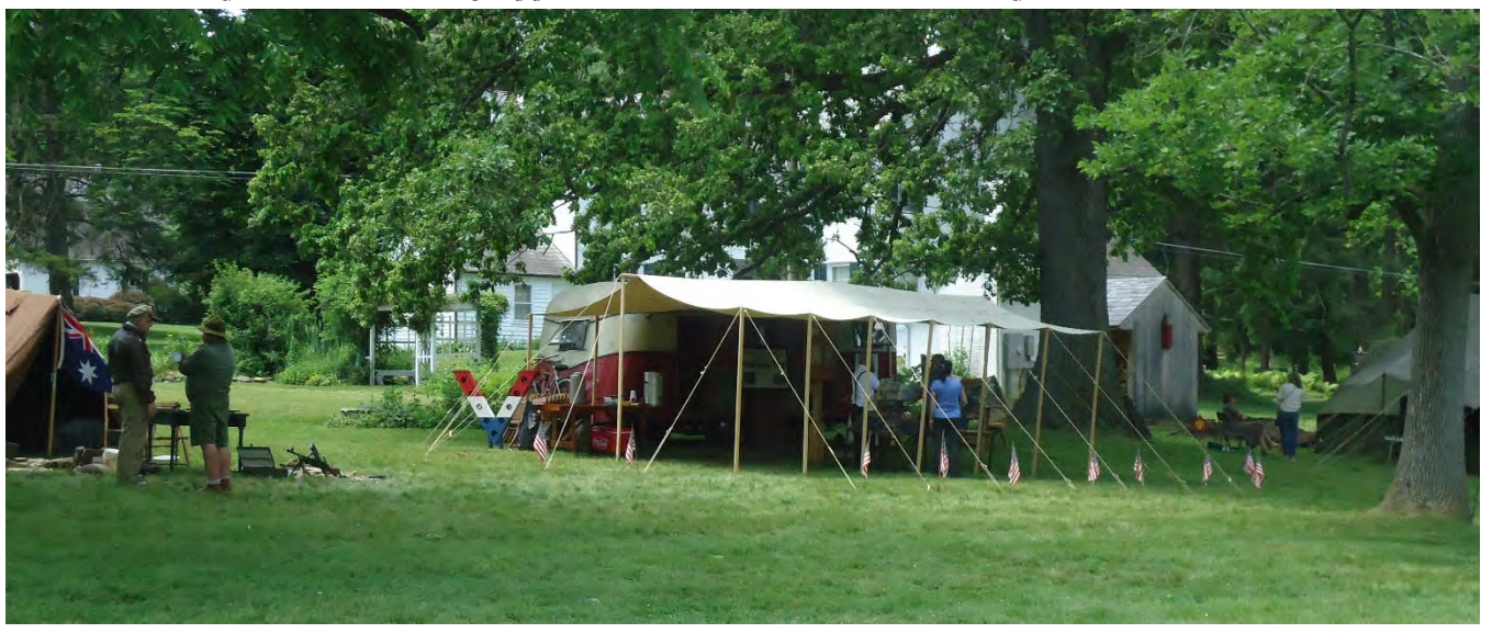
Other vintage vehicles were on display to include this 1920s pickup truck.

One of the best displays is the Salvation Army "Mobile Canteen" trailer. This is a true vintage item well equipped to serve coffee and doughnuts!!!