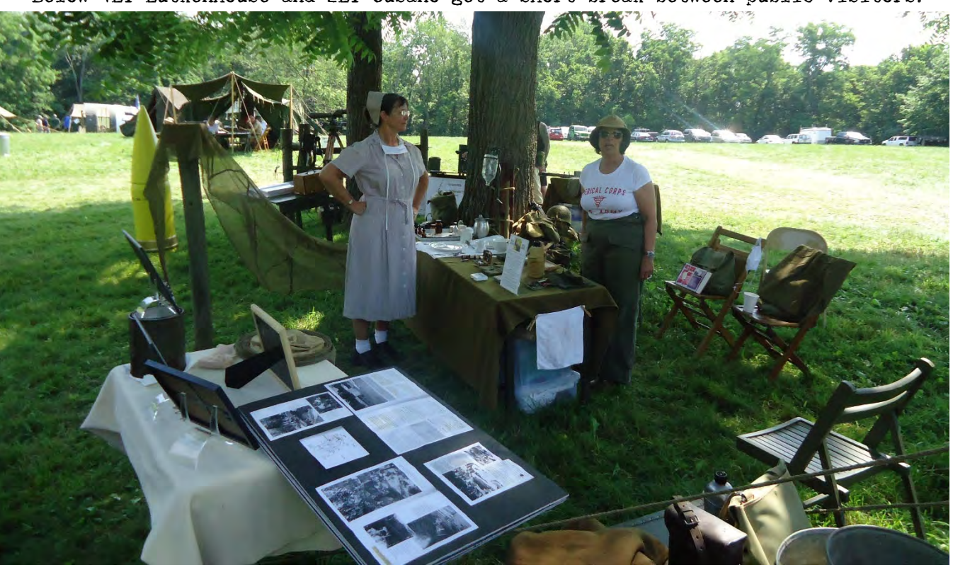
The break was short - they are now fully engaged with visitors.