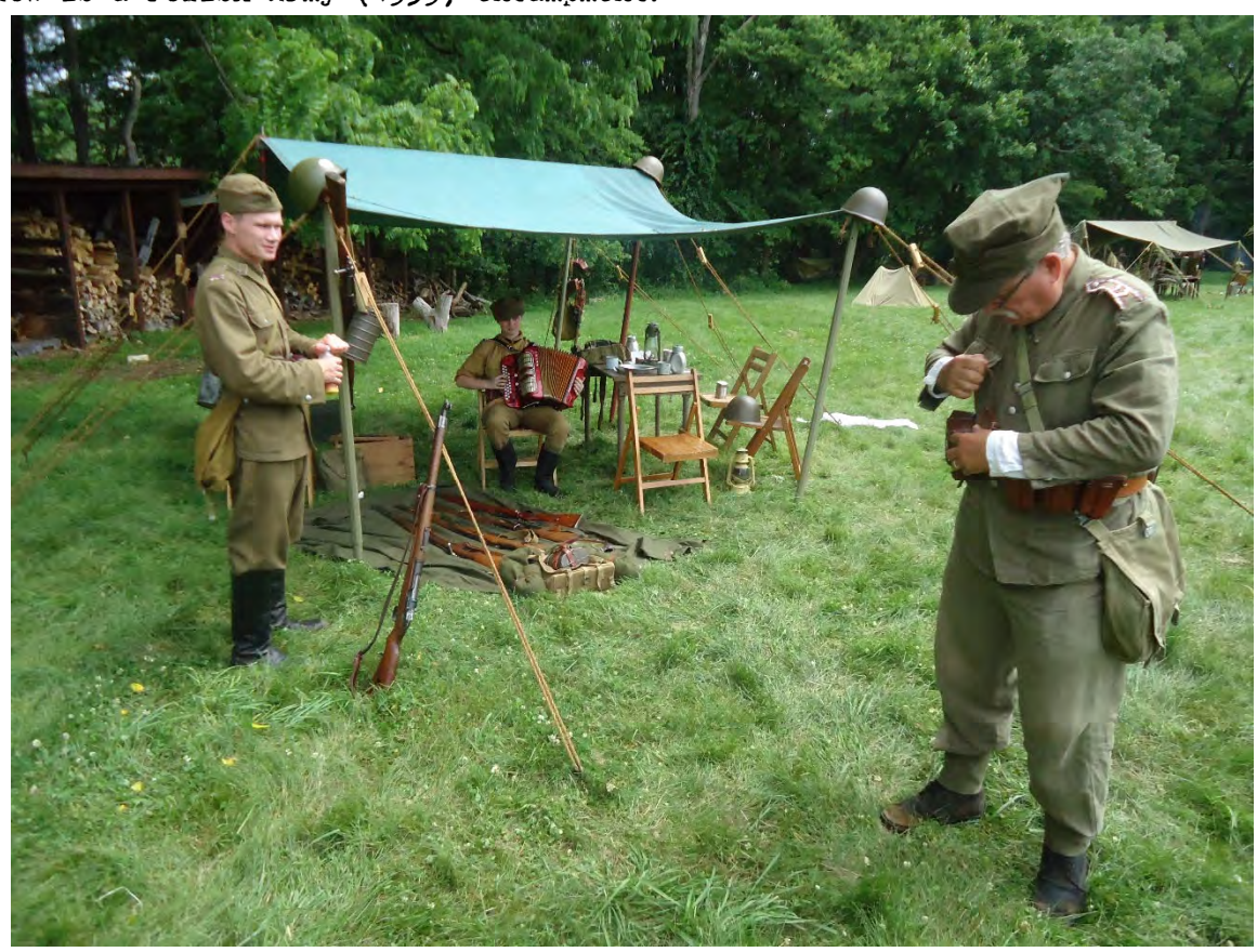
The tent below is full of historic WWII weaponry to include demolition and antitank rockets.