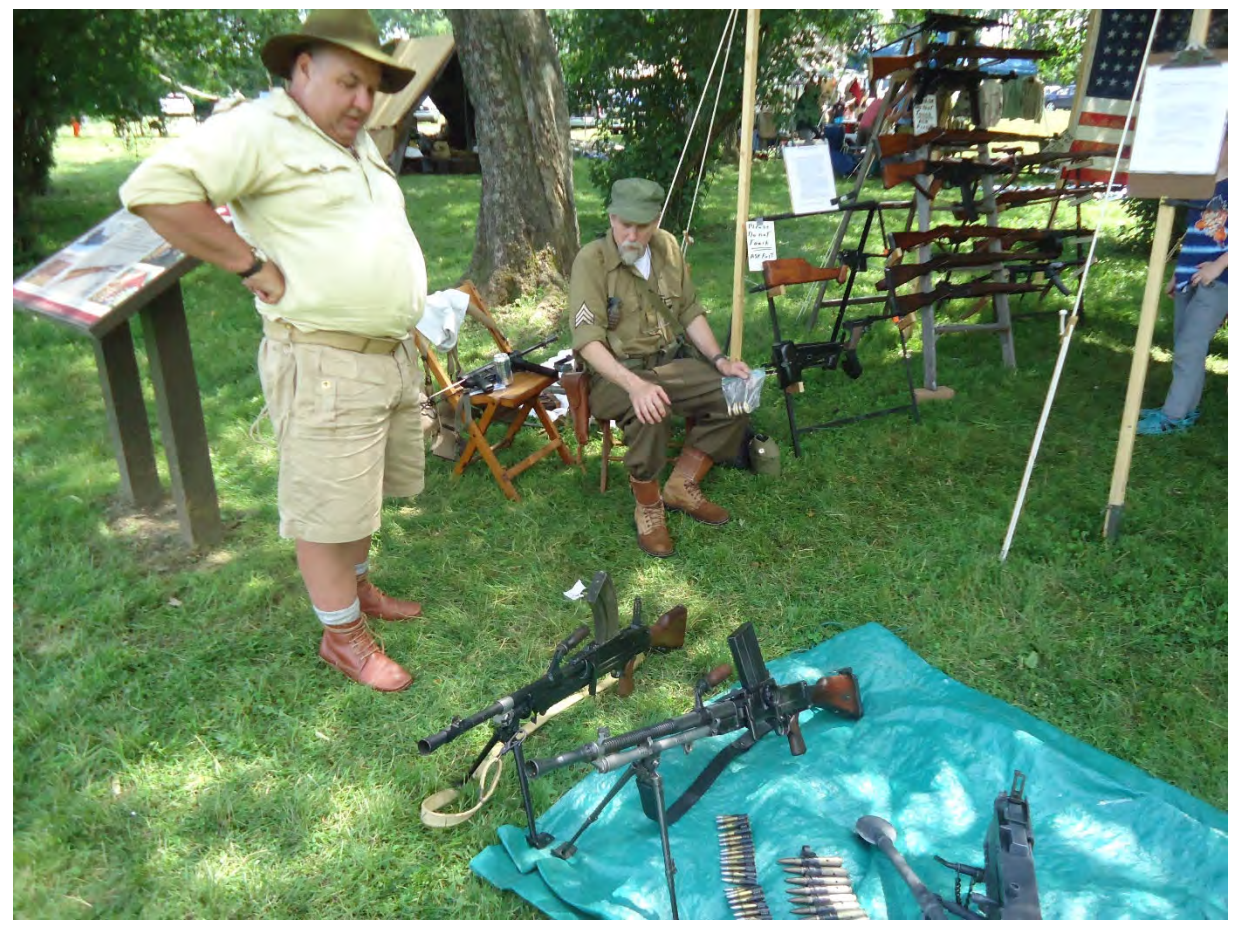
Below is a better look at the two very rare weapons.

There were many historic weapons displays at the event. Below two historians compare their "Bren Guns". These are British squad automatic weapons of the WWII period.