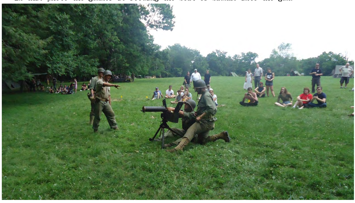
In the photo below the team finishing up loading.