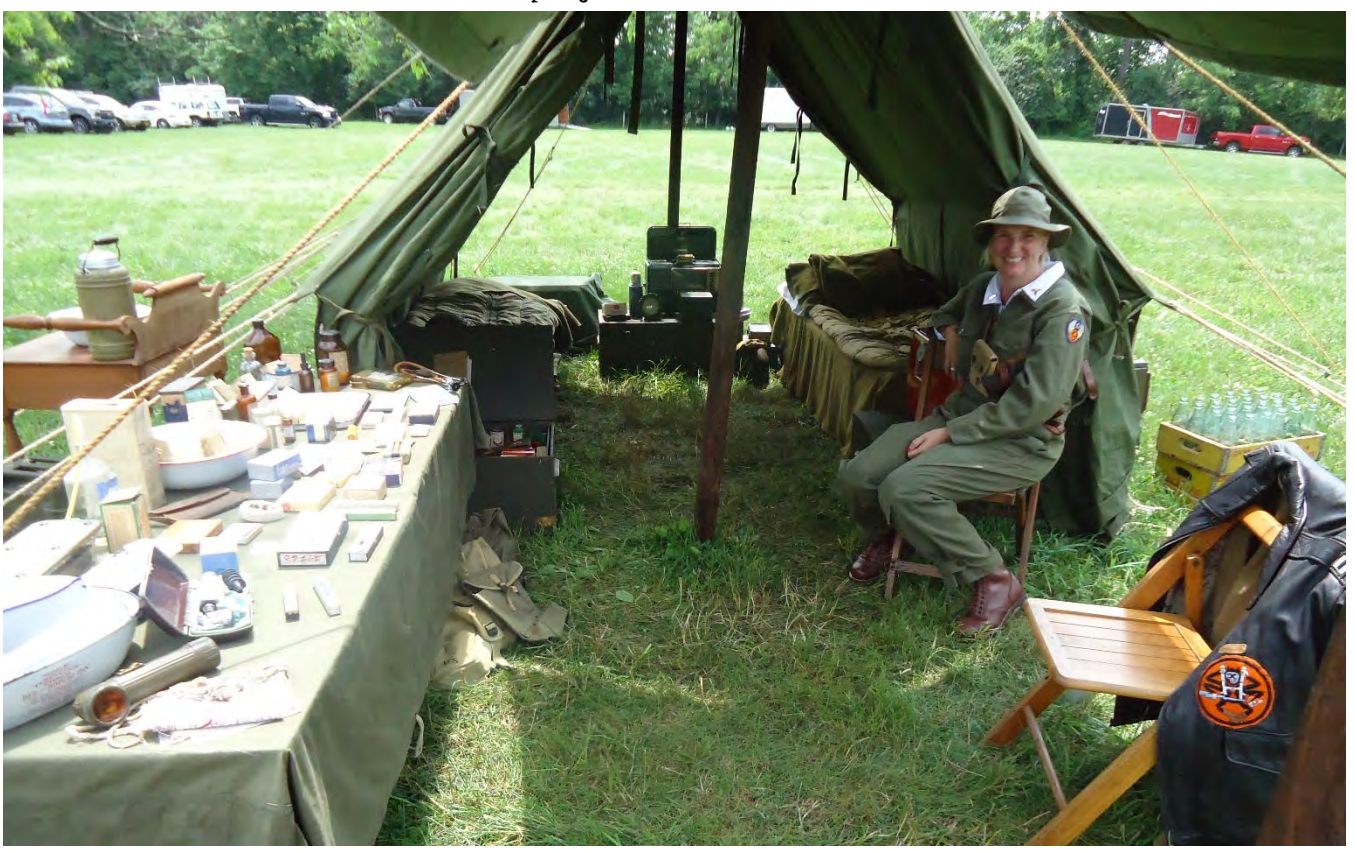
Below is a closer look at the historic medical items that were on display - these are most all vintage and "new old stock" in outstanding condition.