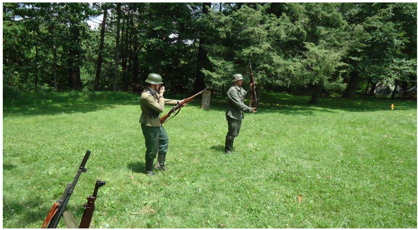
Below a pair of Ukrainian historians demonstrate the M1891 Mosin-Nagant rifle - standard issue of the Soviet Army in WWII.

Below two German Soldiers demonstrate the K-98 Mauser carbine rifle. The soldier on the left is using the microphone for the Bull Horn. Th microphone was connected to the Bull Horn with a 25 foot cable.