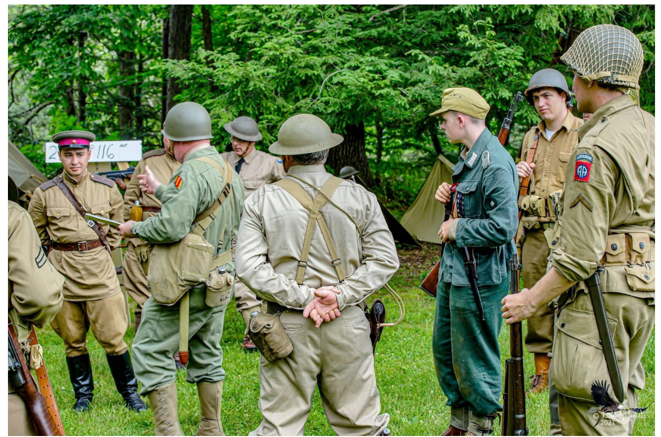
Below the Italians begin their demonstration.

The discussion continues with US early war, US paratroopers, German and Soviet "soldiers".