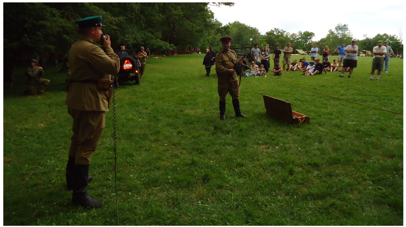
Below three German soldiers demonstrate the K-98 Mauser rifles.

Below Soviet troops begin their demonstration.