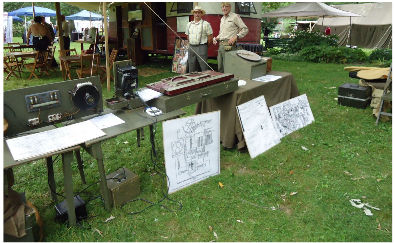
The medical display is shown below along with the Chaplain's tent in the rear center.

The rest of the display to include another EE-91 telephone, a Deflection Board and a Wind Component Indicator - all components of a Seacoast Artillery Plotting Room Fire control instrument suite.