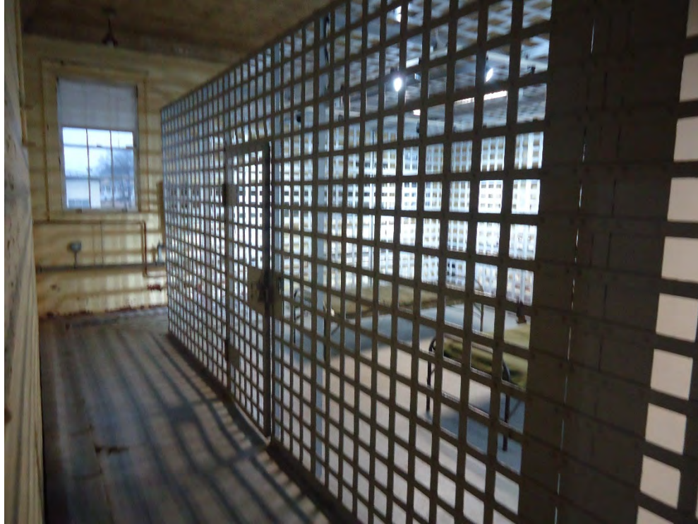
There were spartan hygiene facilities inside the holding cell area.

The Guard House had holding cells in the back rooms. These cells were for soldiers that had misbehaved (often involving alcohol) or otherwise required a "sobering up" period before their leadership got them. Soldiers sentenced to "confinement" would be sent to Castle William on Governor's Island in NY Harbor.