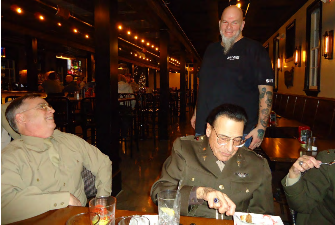
Below part of our team takes the obligatory picture with the “Christmas Mule”!

For Sunday evening, the team ate downstairs. The staff of the Tavern is superior and we had a most wonderful meal and excellent conversation.