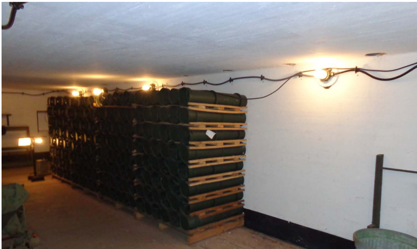
This is Gun #2 powder passage showing about 48 cans already relocated to the passage.

Before we focused in on History House, several AGFA members went to Battery Gunnison/New Battery Peck to move the powder cans in preparation for construction of a new, historically correct, set of racks to store the cans. Below are four of six stacks of cans that were moved - over 200 cans total were moved.