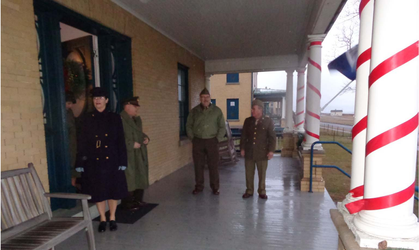
Once everyone had their coats on, we took a picture to memorialize the day.

Towards the end of the afternoon the AGFA team ventured outside on the front porch and the wind was howling!