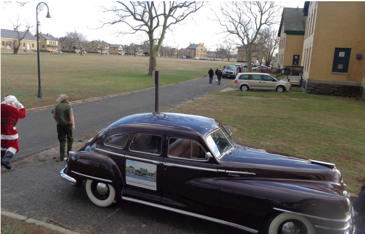
At the end of the day, we took one final picture of the Sunday team.