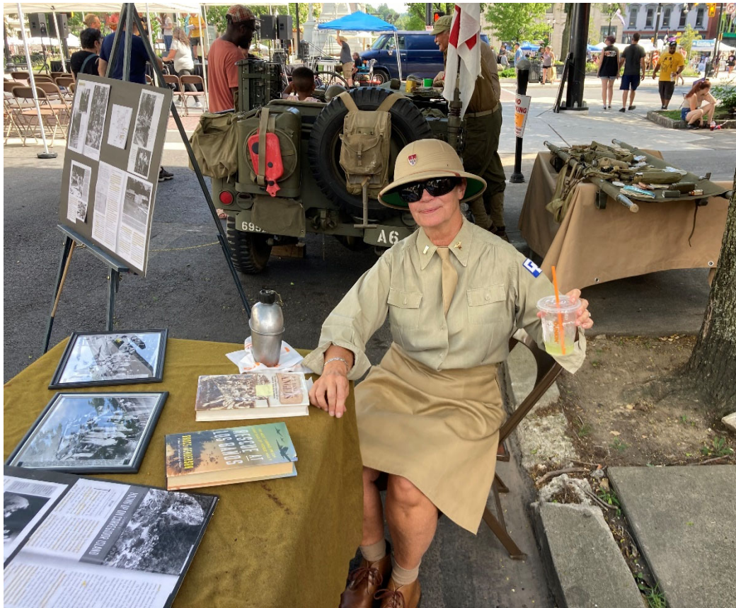
Below is the WWII Army Chaplaincy display.

The Philippines medical operations display also told the story of the US Army nurses surrendered to the Japanese with the fall of Corregidor, and their almost 3 years in internment camps. All lived to come home.