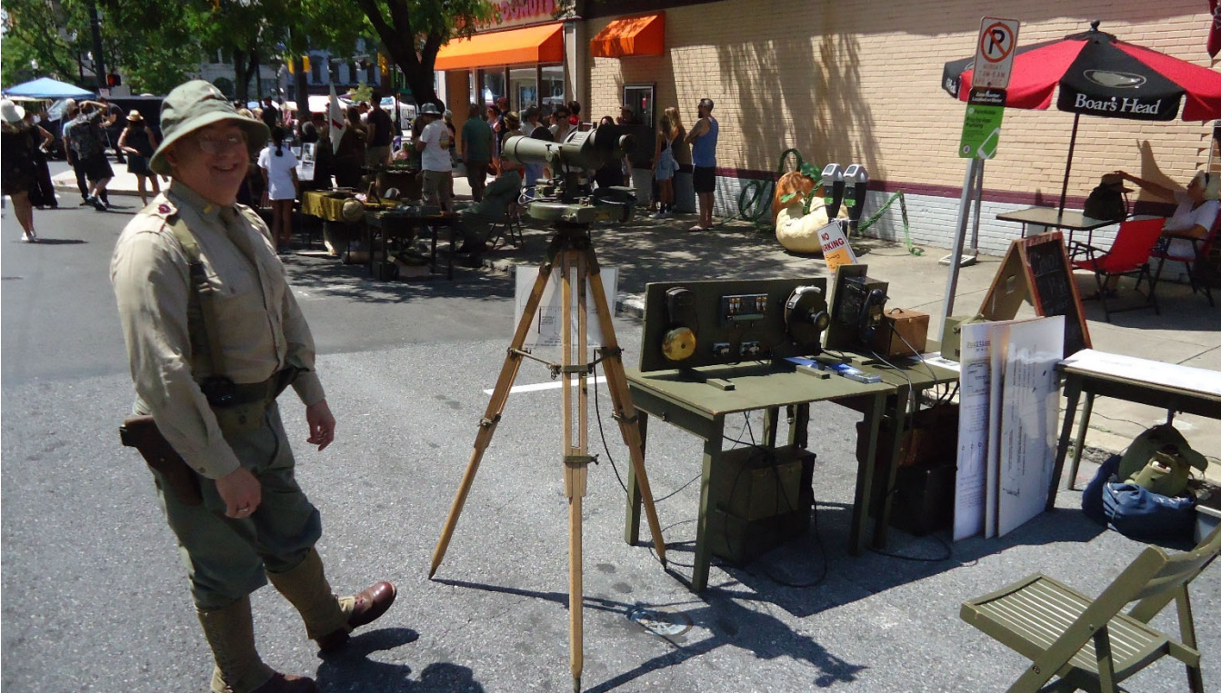
The view below of the Coast Artillery display shows a visitor looking through the M1910A1 Azimuth Instrument.