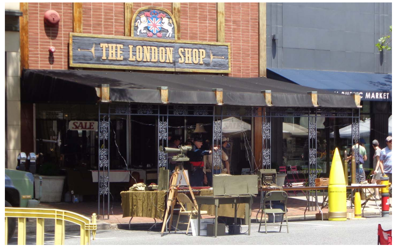
The public enjoyed the M1910A1 azimuth instrument - below a visitor looks through the instrument at the cars parked up the street.

Below is a view of the Coast Artillery Display in front of The London Shop. The medical displays were on tables under the store's canopy to protect them from the sunlight.