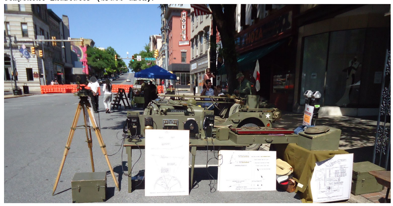
Below 2LT Gonzalez chats with the public about the M1910A1 Azimuth Instrument.

The Coast Artillery display items in this picture include from left to right an M1910A1 Azimuth Instrument, an EE-91 fire control telephone, electrical board with MC-153 Time Interval Bell, another EE-91, an M1905 Deflection board and Wind Component Indicator (brass disk).