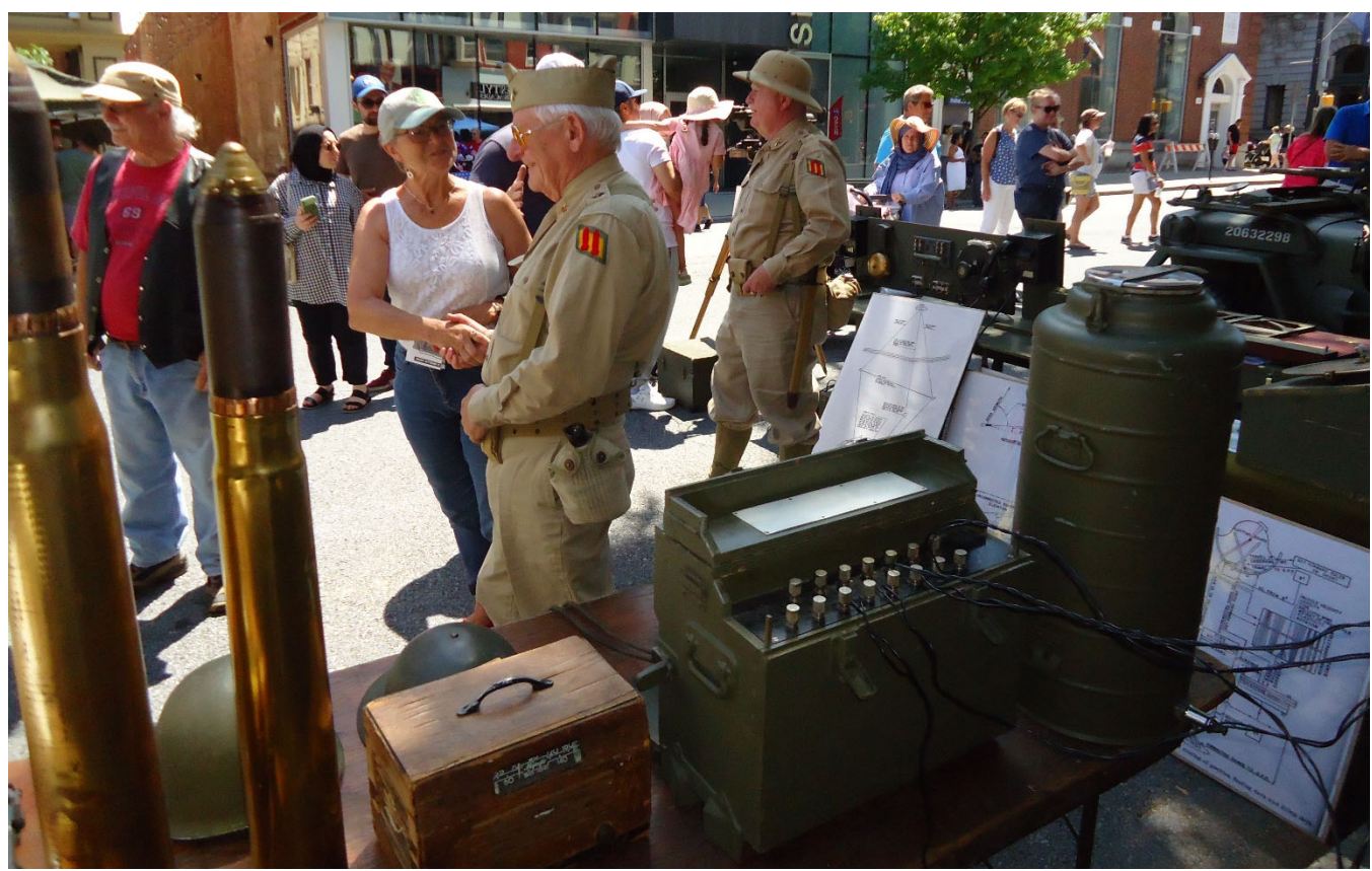
Below 2LT Still continues the discussion with his hand on a 3-inch Anti-Aircraft shell. Between the 3-inch shell and green thermos is a BD-71 six-line switchboard from 1939.