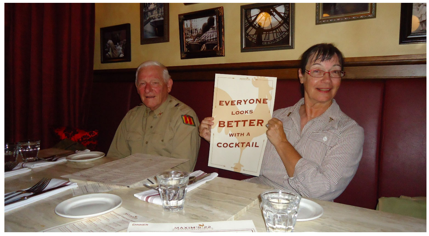
Easton Heritage Days is a very welcoming event with historians from all relevant American time periods of military history. We encourage you to attend!