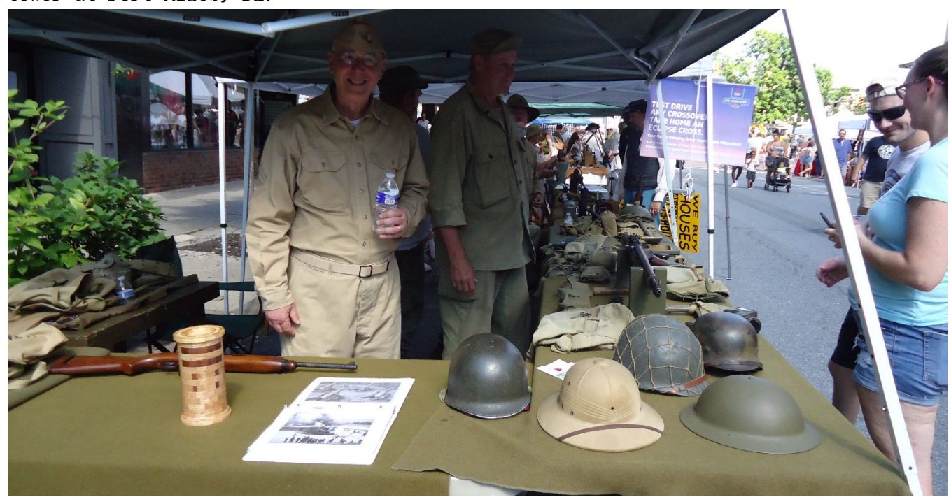
A continuation of the display above focused on small arms weapons.

Another attendee display is shown below with a wooden model of a fire control tower at Fort Miles, DE.