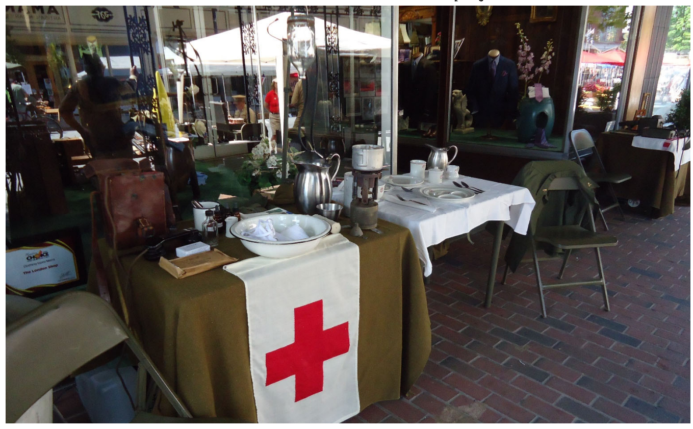
A view of one of the three medical displays.