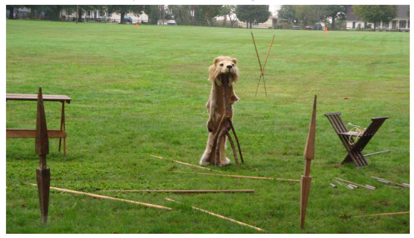
Here, the Roman living historian does a firing demonstration of a "Ballista," a torsion-powered crossbow-like device for hurling large spears at enemy infantry.

Another view of the Roman station is seen below, which includes a lion skin. Such pelts and skins were indicative of rank in the Roman Army, and were also used as unit insignias.