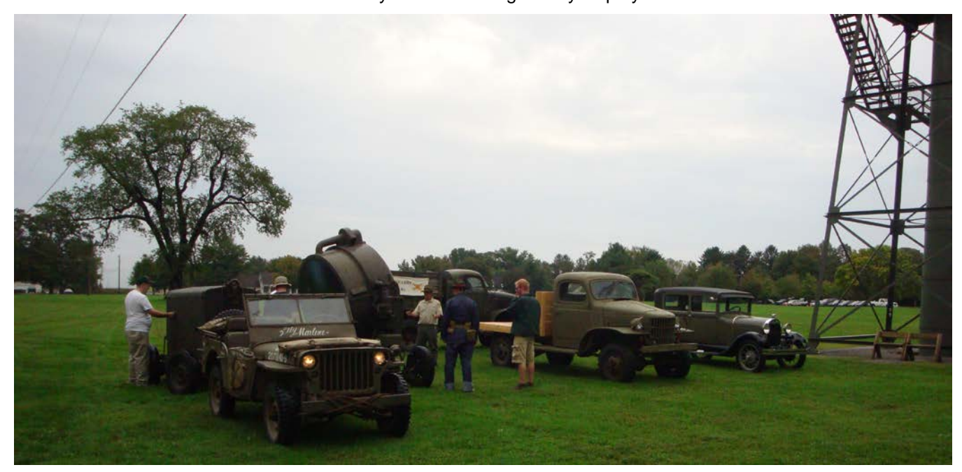
Below, CPL Turner, assisted by PVT Turner, help support visitor access and traffic flow by directing the visitors into the nearby parking lot.

As you can see in the photo below, Fort Mott is amassing a respectable collection of both period military and civilian vehicles to add realism to its various year-round living history displays and events.