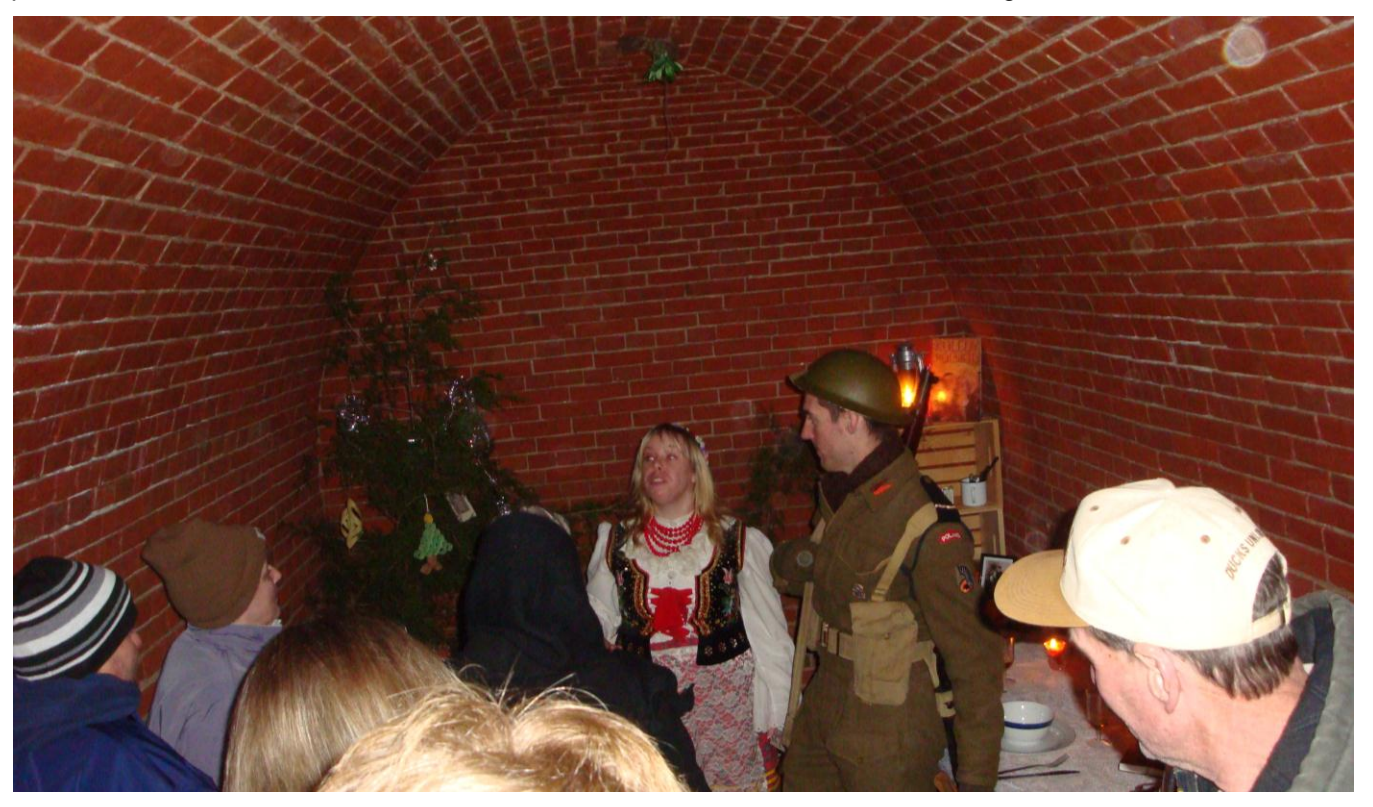
In addition to WWII, another member of this Polish History organization represented the 1600's.

One of the most interesting presentations was that provided on Polish soldiers in WWII. The couple below provided detailed information about Polish Christmas customs and unit actions during WWII.