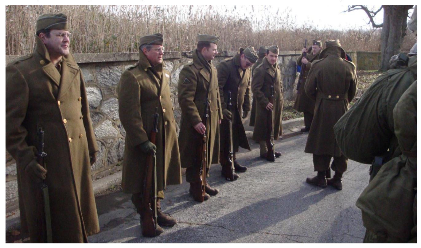
Unlike 2010, many different organizations supported the "Wreaths Across America" event at Finns Point National Cemetery.

In the photo below, members of the 9<sup>th</sup> Infantry Division Historical Association gather at Finns Point National Cemetery for the raising of the colors prior to the start of "Wreaths Across America" ceremony.