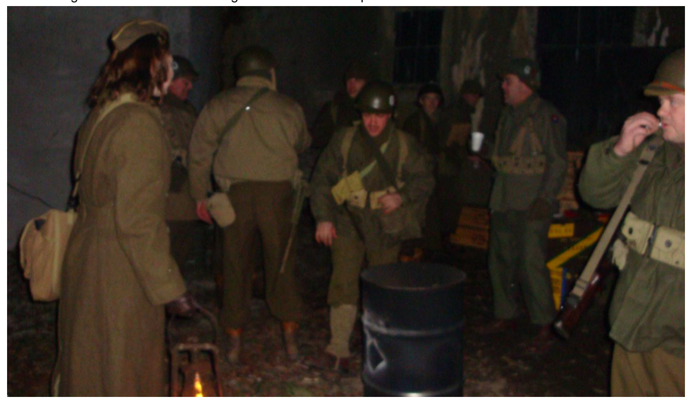
Inside the switchboard room for Fort Mott the 9<sup>th</sup> Infantry set up their command post with period equipment and a functioning BD-72 switchboard. You really did step into 1944 when entering this room.

The 9th Infantry Division WWII Historical Preservation Society (http://www.9thdivision.com) presented a vignette about US soldiers in the Ardennes in December 1944 being ordered to the front to stop a German breakthrough. It was a most interesting and well-rehearsed presentation.