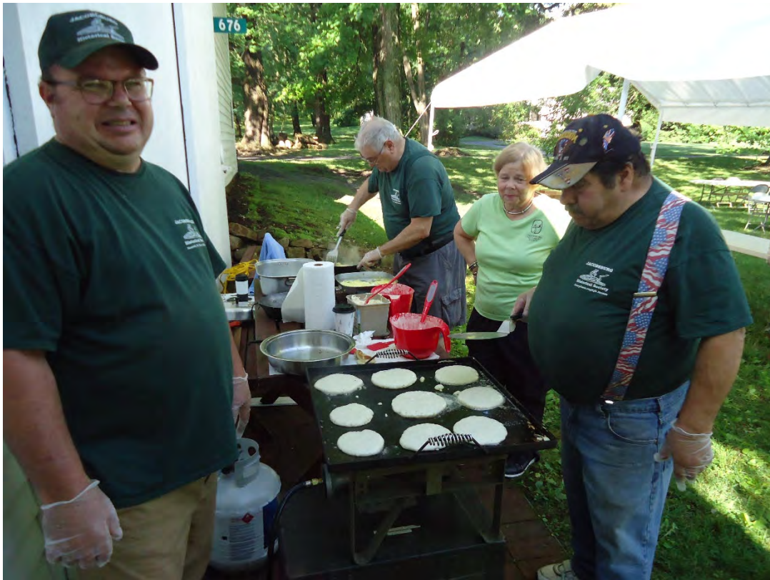
Sunday breakfast was a welcome event - below historians get in line for chow.

On Sunday, the Jacobsburg Historic Society ( https://www.jacobsburghistory.com/ ) provided a hot breakfast to all the historians and other participants at the WWII Weekend.