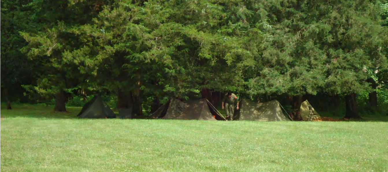
Below is German/Italian medical encampment.

There were many organizations represented at Jacobsburg. Below an Allied infantry camp of the 45 th ID was nestled into the woodline.