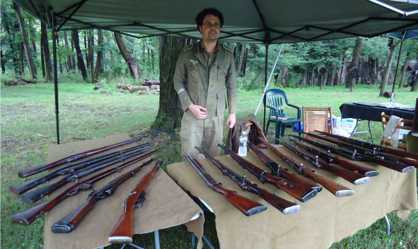
Another German medical exhibit was right next to the Axis weapons display.

One of the major aspects of the German encampment area is a very extensive rifle exhibit covering most of the WWII period axis weapons.