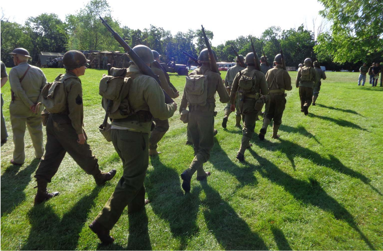
Approximately 80 historians were in formation for the flag raising and paying respect to our Nation's colors.

The next morning at 0830, all the historians gathered for the flag raising ceremony.