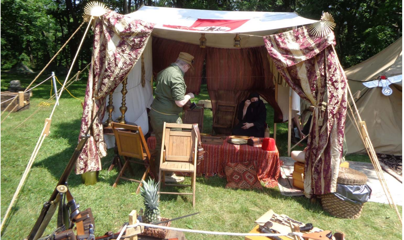
Below is the MG-42 machinegun station at the Afrika Corps encampment.

One enterprising group set up a Afrika Corps (German) encampment to include Arab tent and correct military equipment.