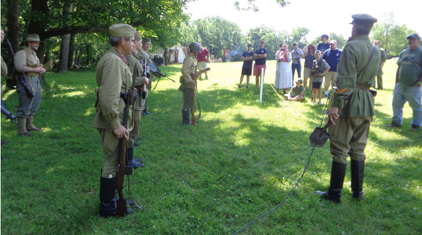
After the Soviets, the Australians demonstrated their Enfield rifles.

At 1000 in the morning, LTC Welch worked with several of the historians to conduct the "weapons demonstration". Below, the Soviets provide demonstrations of their weapons.