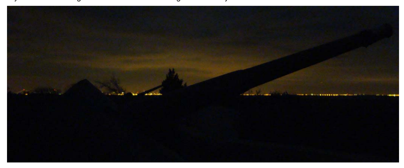
Gun #1 of Battery Gunnison/New Peck points ominously towards the Atlantic Ocean under a cloudy night sky on eternal vigilance to protect the citizens of the United States and the garrison of Fort Hancock, New Jersey.

As members departed Fort Hancock for the last time in 2010, we took the photo below of the New York City skyline silhouetted against the two 6-inch M1900 guns of Battery Gunnison/New Peck.