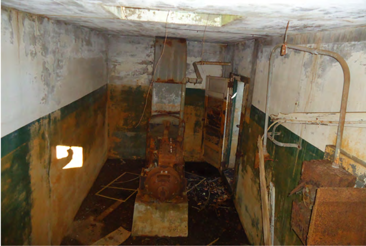
Below CPL Cusano looks over the existing pump motor.

The AGFA team was also shown (location undisclosed) one of the old, out of service wells at Fort Hancock. This well was apparently constructed in 1940-41.