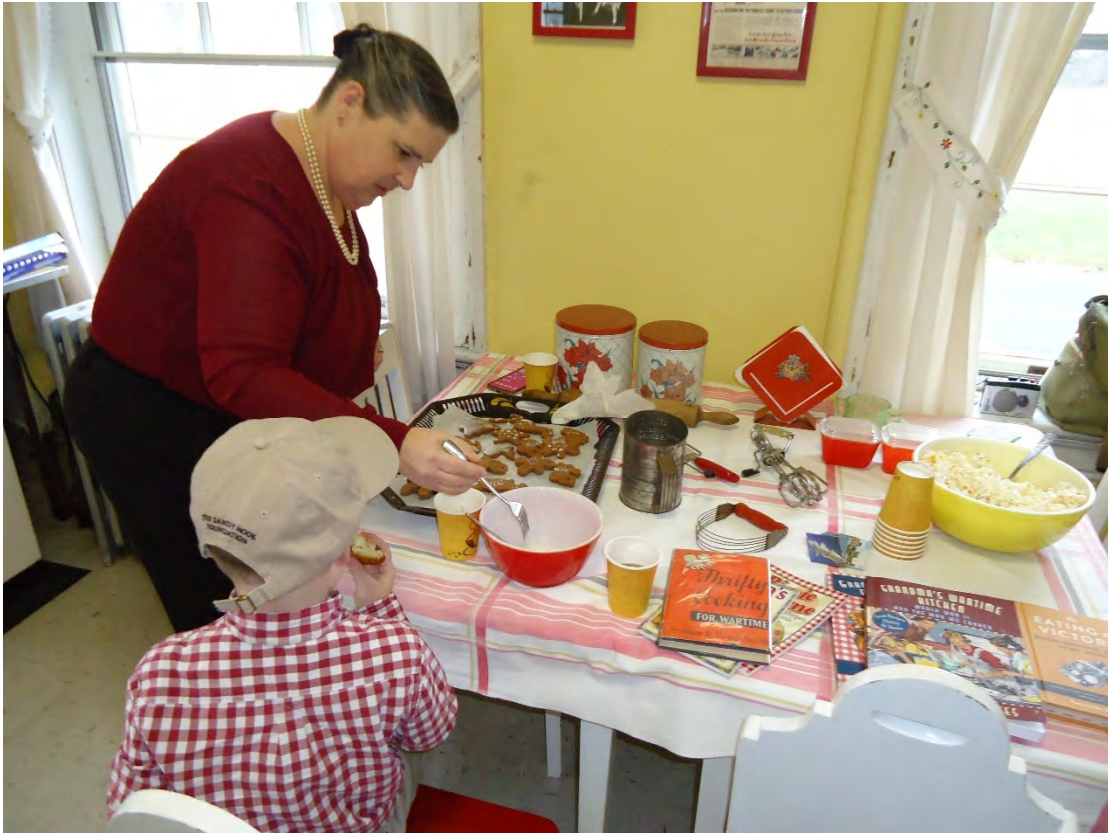
Below all three kids begin work on the decorations - these are ginger bread cookies made to a 1940s wartime recipe. This is the "icing" step of the process.