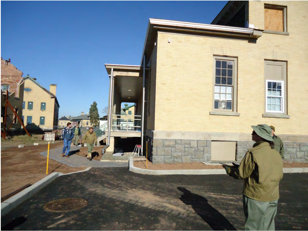
Below AGFA members are on the “front” porch of the building facing Bldg. #23.