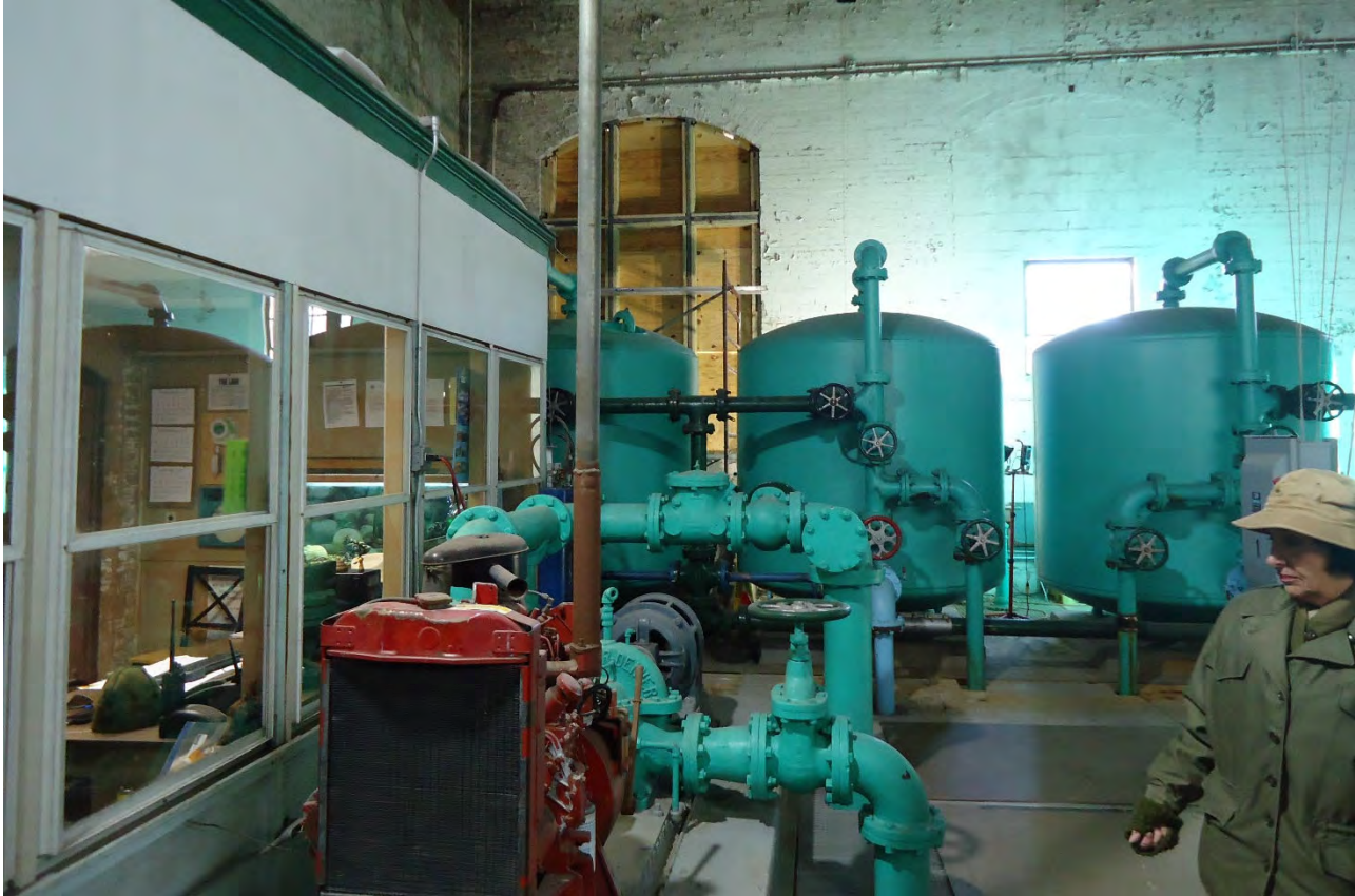
The two pumps below are the main source of water movement in the filtration system.

2LT Cusano looks at a historic auxiliary pump from the 1950s. Along the back wall are three of the other four sand filters. Note also the large cathedral window being installed to the center left. The remaining three windows will be installed in the near future.