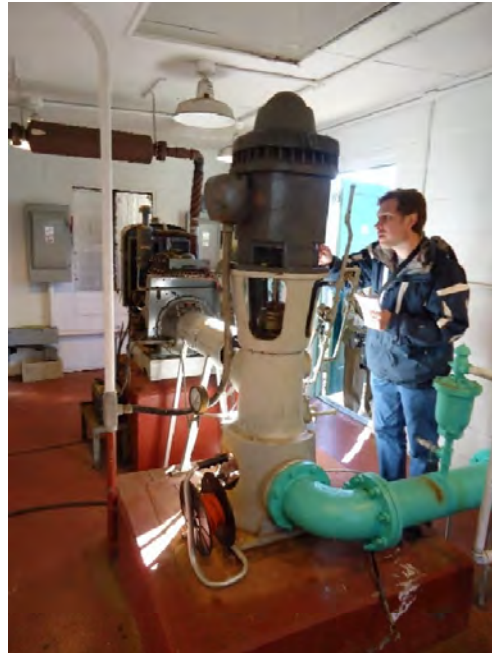
The pump backup gasoline motor is present in the foreground.