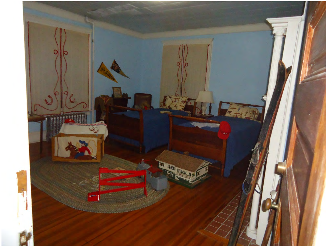
Another view of the room showing the twin beds and the fireplace.

Below is one of three pictures of a child's bedroom. Notice the curtains and toys.